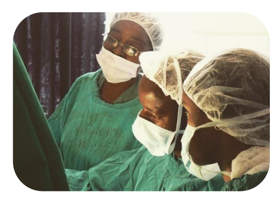
THANK YOU to the 86 individuals and families as well as the 14 businesses and churches who gave financially this month!