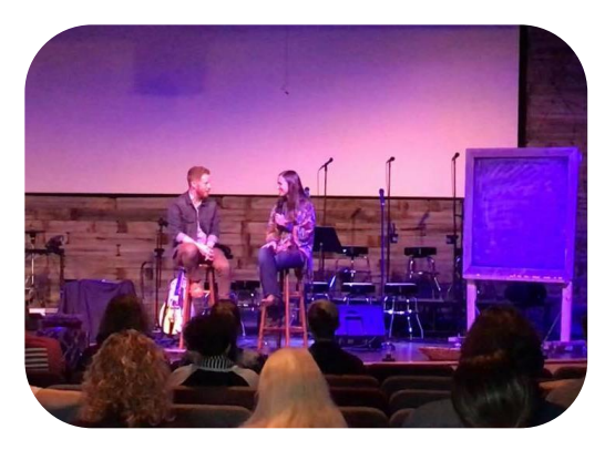
THANK YOU to the 65 individuals and families as well as the 7 businesses and churches who gave financially this month!