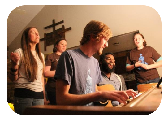
THANK YOU to the 44 individuals & families who shared in tangible donations this month!