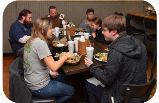
THANK YOU to the 64 individuals and families as well as the 6 businesses and churches who gave financially this month!