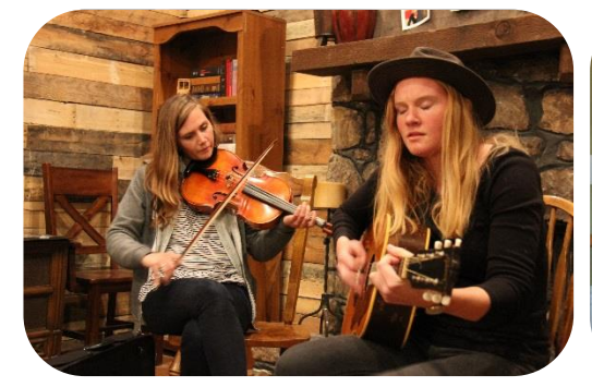
THANK YOU to the 28 individuals & families who shared in tangible donations this month!