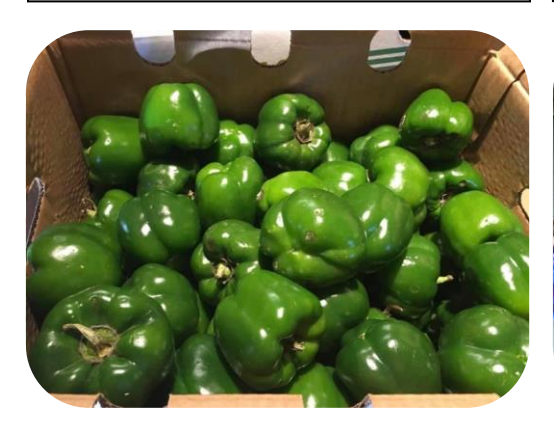
THANK YOU to the 93 individuals & families who shared in tangible donations this month!