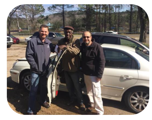
THANK YOU to the 99 individuals and families as well as the 17 businesses and churches who gave financially this month!